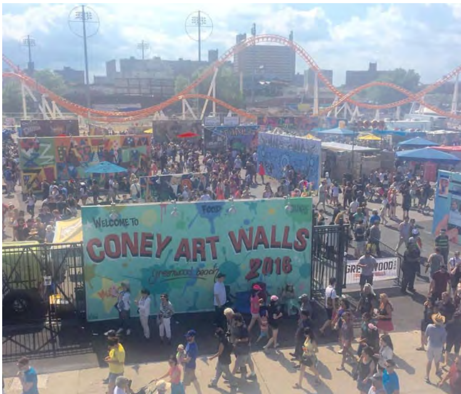
Coney Art Walls